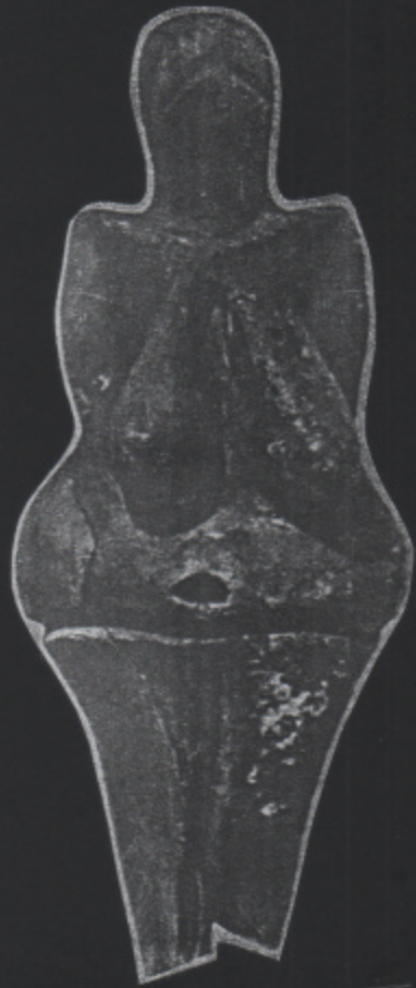
ice" (two views), from Dolni Clay with bone ash, height Museum, Brno, Czechoslovakia.