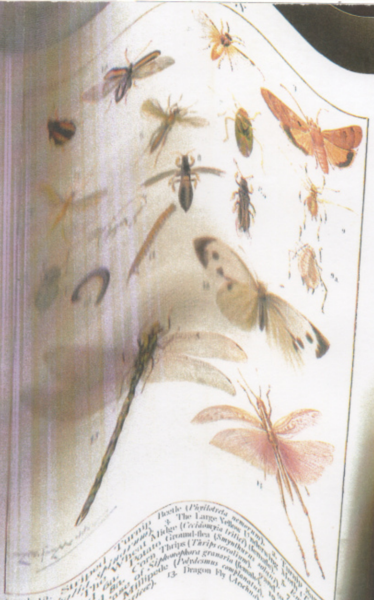
1. Sand fly ( Siphonura ) 2. Turnip (male) ( Tribolium ) 3. Phylloreta nemorum 4. Phylloreta nemorum 5. The Large Yellow 6. Phylloreta nemorum 7. Midge ( Cecidomyia tritici ) 8. Phylloreta nemorum 9. Phylloreta nemorum 10. Phylloreta nemorum 11. Phylloreta nemorum 12. Phylloreta nemorum 13. Dragon Fly ( Aeschna ) 14. Phylloreta nemorum

What legal in ar- mon; it be -or- pho- otho- -or- dia; or- do- out to ing no to to e