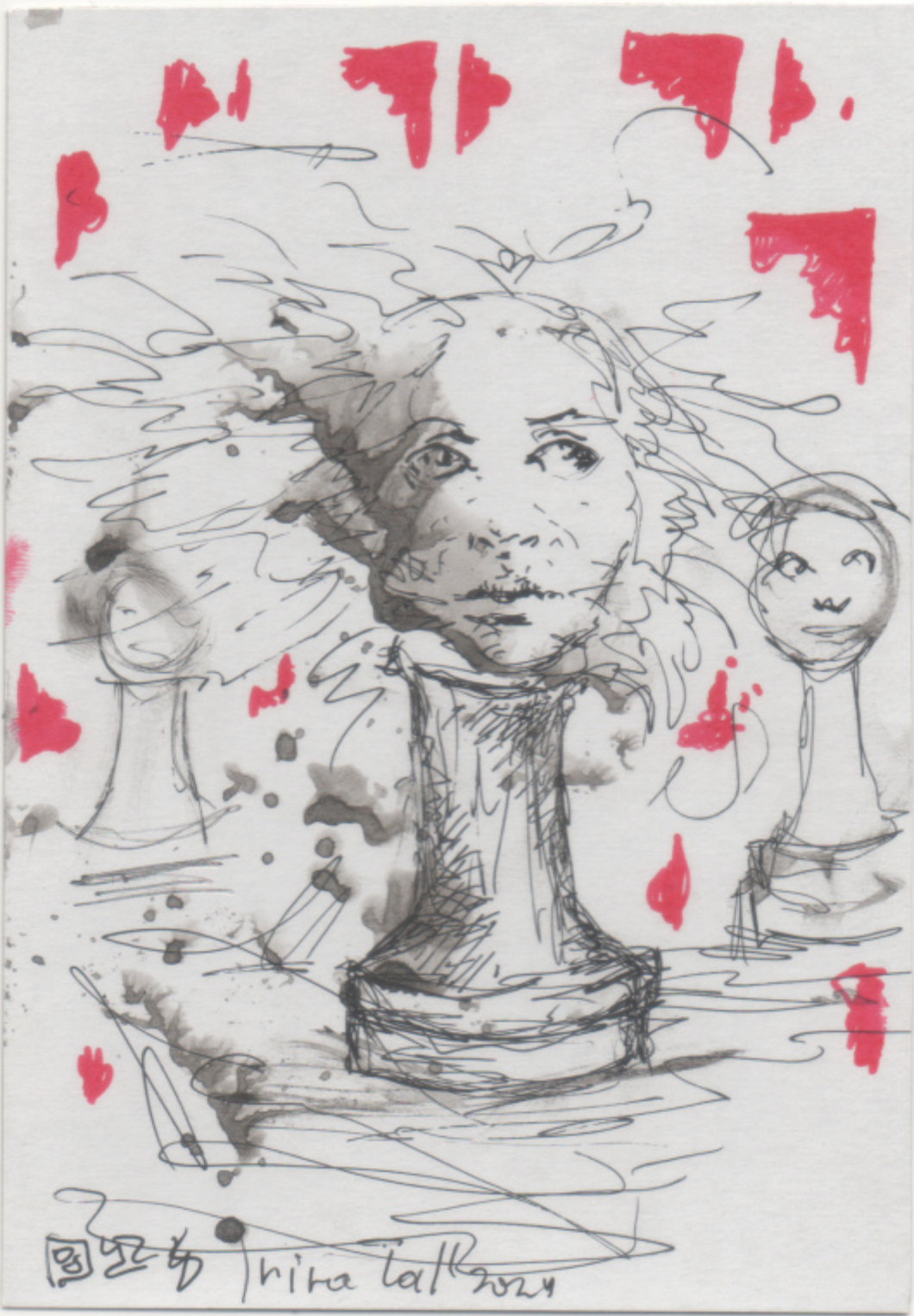
图 22 号 | Nira Lal 2024