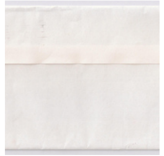
QC.2022.ACERVO.0007 PRJ A