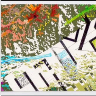
QC.2022.ACERVO.0007 PRJ 001

técnica mista > 103 x 225 mm envelope > 109 x 230 mm 2022